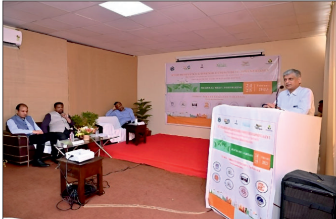
Regional Meeting in Varanasi

On February 24-25, 2023, a regional meeting was convened in Varanasi, hosted by the Uttar Pradesh New and Renewable Energy Development Agency (UPNEDA) on behalf of